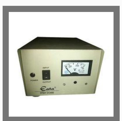
Step Down Voltage Converter