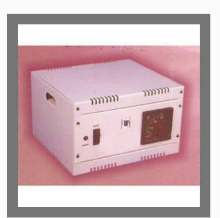
Automatic Step Up Voltage Stabilizer