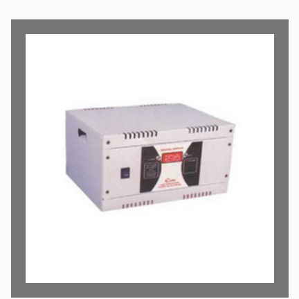
Automatic Voltage Stabilizer with Digital Display