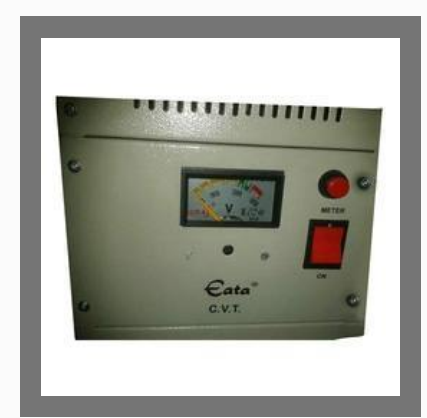
Constant Voltage Transformer