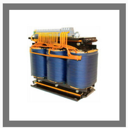
Three Phase Transformer