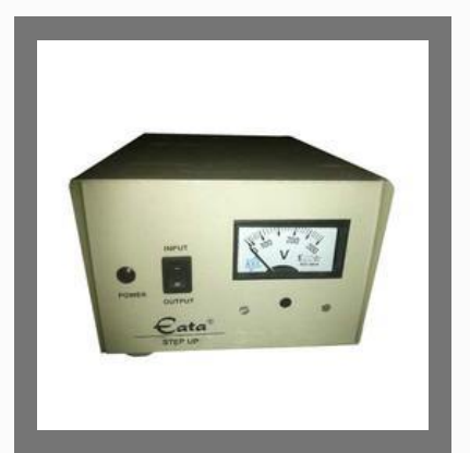
Step Up Voltage Converter