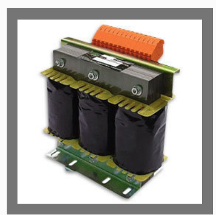
Single Phase Transformer