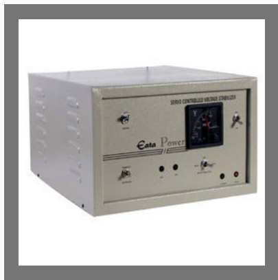
Servo Controlled Voltage Stabilizer