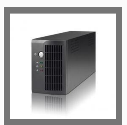
LCD Home UPS